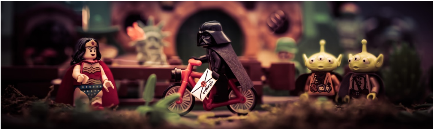
Boris Vanrillaer, @_Me2_, The Dark Knight™ , Metallic Paper on Plexi, 2013