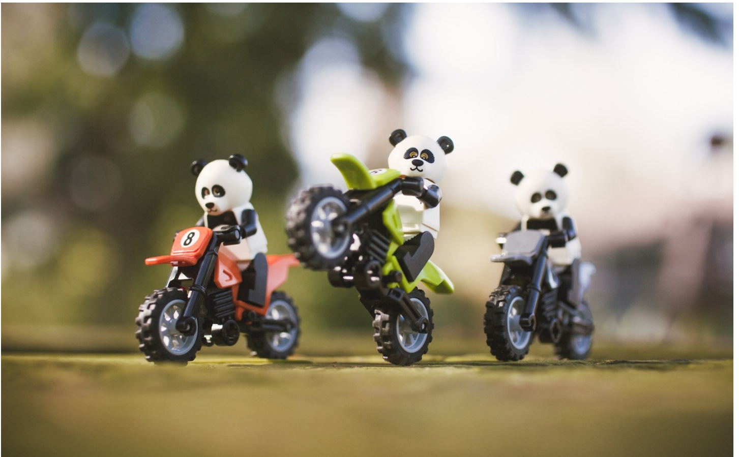
Shelly Corbett, @xxSJC, Panda Pop , Archival Pigment Print on Arches Paper, 2014, 35" x 48"